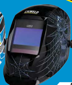
Web P/N: 454351