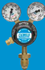
OXYGEN P/N: 210222