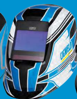
Pro Racer P/N: 454353