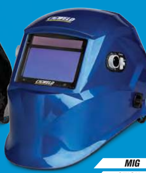
Blue P/N: 454331