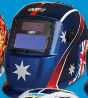
Oz Flag P/N: 454324