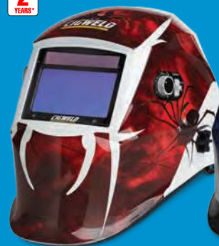
Spider P/N: 454343