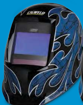
Barbed Wire P/N: 454352