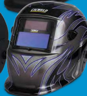
Tribal P/N: 454322