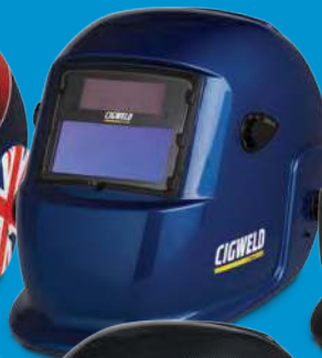
Blue P/N: 454305