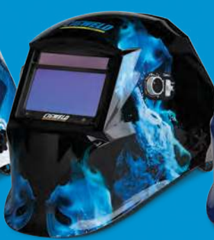
Howling Wolf P/N: 454342