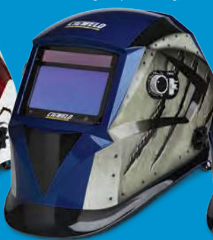
Claw P/N: 454333