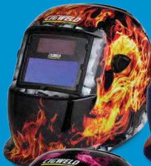
Flaming Skull P/N: 454335