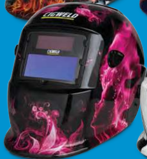
Pink Lady P/N: 454336