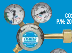
CO2 P/N: 201008