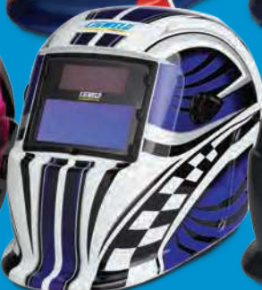
Racer P/N: 454321