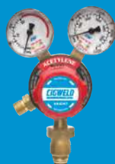
ACETYLENE P/N: 210223