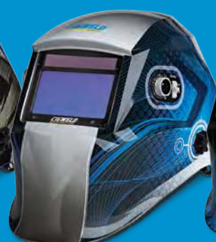
Space P/N: 454332