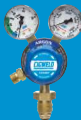
ARGON P/N: 210254