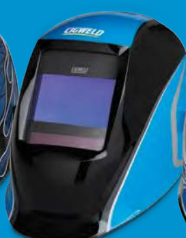
Blue P/N: 454350