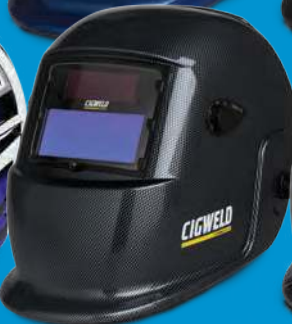
Carbon Fibre P/N: 454314