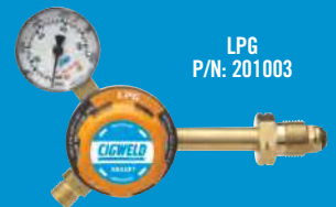
LPG P/N: 201003

Specifically designed for the budget conscious buyer, CutSkill regulators offer excellent quality and performance for use with most light to medium applications.